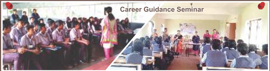
Career Guidance Seminar