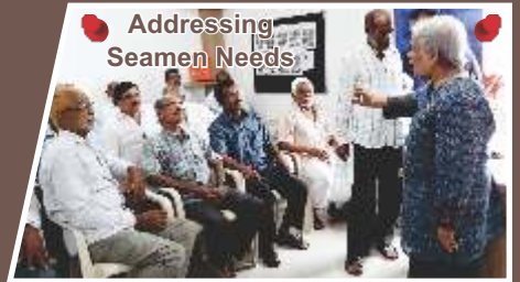
Addressing Seamen Needs